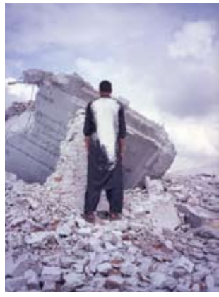
Lida Abdul (Afghanistan, b. 1973) White House, 2005–6 Single-channel video, color, sound, 5 min. Documentation of a performance in Afghanistan, 2005 Lent by the artist and Giorgio Persano Gallery, Turin