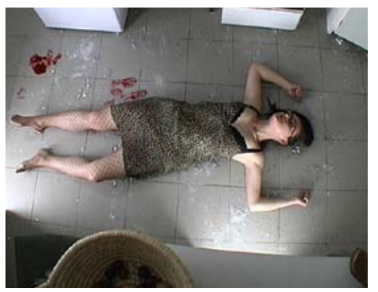
Anna Baumgart (Poland, b. 1966) Ecstatic, Hysteric, and Other Saintly Ladies (Ekstatyczki, histeryczki i inne świete), 2004 Video, color, sound, 11 min. Lent by the artist, Warsaw