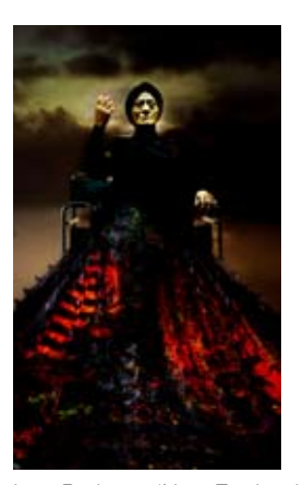
Lisa Reihana (New Zealand, b. 1964) Mahuika, from the Digital Marae series, 2001 Digital photograph, 78 x 46 7/8" (198.1 x 119.1 cm) Courtesy of the artist