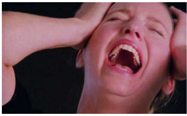
Sam Taylor-Wood (U.K., b. 1967) Hysteria, 1997 Single-channel video with no sound, 8 min. Courtesy of the artist and Jay Jopling/White Cube, London © Sam Taylor-Wood (Photo: courtesy of Jay Jopling/White Cube, London)