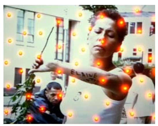
Rebecca Belmore (Canada, b. 1960) The Named and the Unnamed, 2002 Video installation with light bulbs, edition of 2; 7' 4 1/8" x 8' 11 7/8" (2.24 x 2.74 m) Collection of Morris and Helen Belkin Art Gallery, the University of British Columbia, Vancouver, Canada