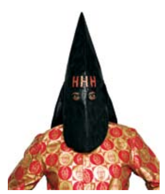
Fiona Foley (Australia, b. 1964) HHH #4 from the Hedonistic Honkey Haters series, 2004 Ultrachrome print, 39 7/10 x 29 9/10" (101 x 76 cm) Courtesy of the artist and Niagara Galleries, Melbourne, Australia