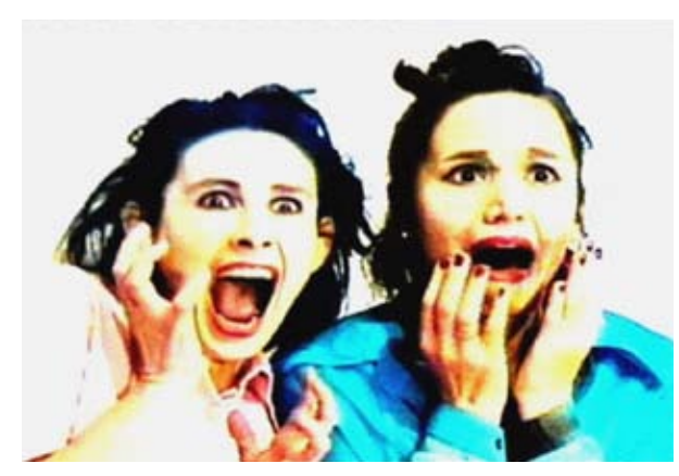
Boryana Rossa (Bulgaria, b. 1972) Celebrating the Next Twinkling (Praznuvane na sledvascia mig), 1999 Single-channel video, color, sound, 2 min. 45 sec., edition of 2 Private collection