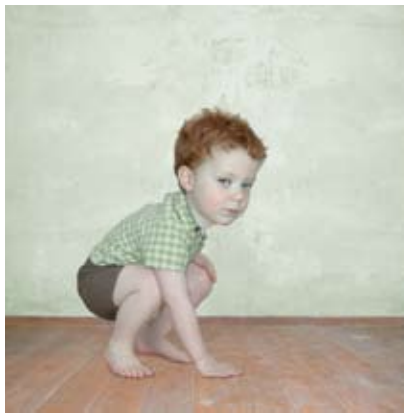
Loretta Lux (Germany, b. 1969) Study of a Boy 1, 2002 Ilfochrome print, 11 3/4 x 11 3/4" (30 x 30 cm) Brooklyn Museum, Gift of Kenneth H. Schweber