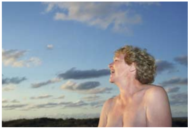
Melanie Manchot (Germany, b. 1966) With Blue Clouds and Laughter, 2003 Chromogenic print, 39 1/2 x 50" (100.3 x 127 cm) Melanie Manchot, Courtesy of Fred [London] Ltd. and Goff and Rosenthal, New York