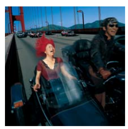
Miwa Yanagi (Japan, b. 1967) Yuka, from the My Grandmothers series, 2000 Chromogenic print on Plexiglas, mounted on aluminum, 63 x 63" (160 x 160 cm) Collection of Linda Pace, San Antonio, Texas