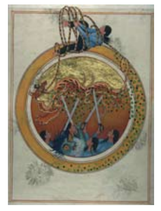
Ambreen Butt (Pakistan, b. 1969) Untitled, from the I Need a Hero series, 2005 Watercolor, white gouache, and gold leaf on wasli paper, 10 1/2 x 8" (26.7 x 20.3 cm) or 13 x 9 1/2" (33 x 24.1 cm) Collection of Edward M. Reisner, New York