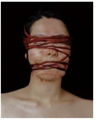
Ryoko Suzuki (Japan, b. 1970) One work from the Bind series, 2001 Lambda print, 78 3/4 x 57 1/8" (200 x 145 cm)