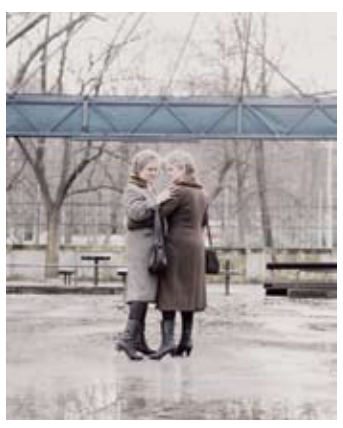
Milena Dopitová (Czech Republic, b. 1963) Dance, from the Sixtysomething series, 2003 Digital inkjet print mounted on 1/4" Cintra board, 65 x 52 3/4" (165.1 x 134 cm), edition of 5 Jiri Svestka Gallery, Prague