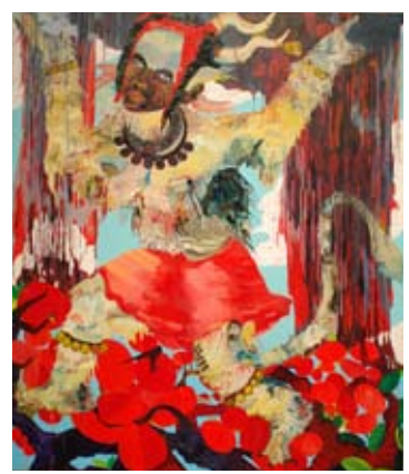
Mequitta Ahuja (U.S.A., b. 1976) Boogie Woogie, 2005 Oil on canvas, 84 x 72" (213.4 x 182.9 cm) Ulrich Museum of Art, Wichita State University, Kansas