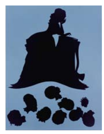
Kara Walker (U.S.A., b. 1969) Scene #26, from the Emancipation Approximation series, 2000 Silkscreen print, edition of 20, each 44 x 34" (111.8 x 86.4 cm) Sikkema Jenkins & Co., New York